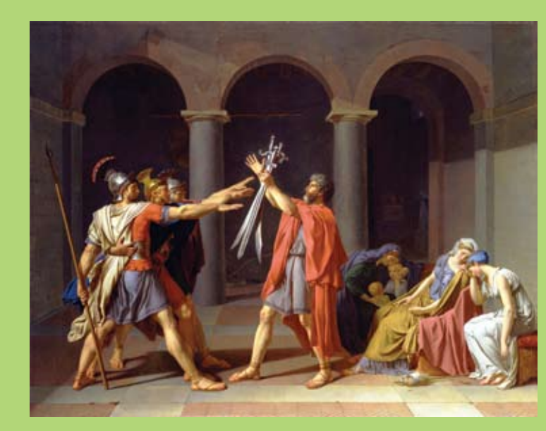
Gallery 28A | Jacques-Louis David (French, 1748–1825) The Oath of the Horatii . Oil on canvas, 1786. Purchased with funds from the Libbey Endowment, Gift of Edward Drummond Libbey, 1950.308

Epic: a narrative poem about gods, heroes or legendary events. Greek vases or paintings of battle scenes or historical events are visual representations of an epic. This painting depicts a story from ancient Rome.