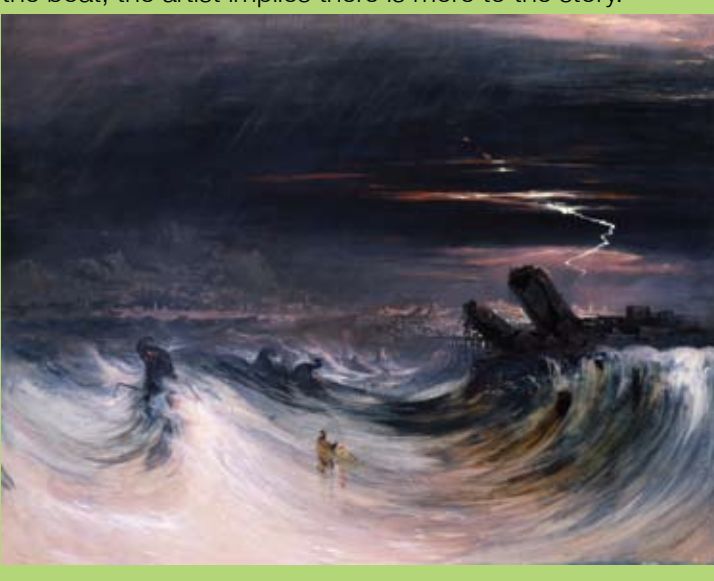
Gallery 31 | John Martin (British, 1789–1854) The Destruction of Tyre. Oil on canvas, 1840. Purchased with funds from the Libbey Endowment, Gift of Edward Drummond Libbey, 1952.88

Foreshadowing: use of hints or clues to suggest what will happen later. Because they are frozen in a particular moment in time, many paintings create a sense that climactic action is about to take place. By including the small figure in the boat, the artist implies there is more to the story.