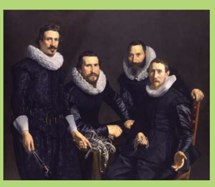
Gallery 23 | Thomas de Keyser (Dutch, 1596/97–1667) The Syndics of the Amsterdam Goldsmiths Guild. Oil on canvas, 1627. Museum purchase, 1960.11

Symbols: words or objects used to represent an idea or convey deeper meaning. Artists and authors use symbols to evoke a response or illustrate a point. The objects in this painting identify the employment of these individuals.